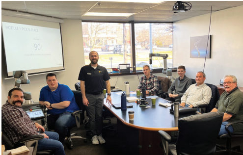
Product training with customers and staff at Precision Robotics

As a team, we have a deep understanding of how to create measurable value through automation. Our principals offer trust developed over decades in the automation and manufacturing industry.